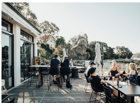
Fabric Cafe and Bistro