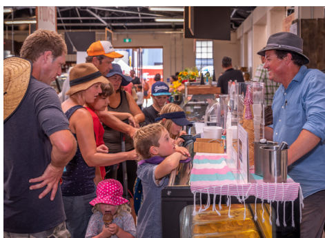
Catalina Bay Farmers Market

(behind Catalina Cafe) to meet with our friendly Information Centre manager, who can give you an overview of the different neighbourhoods and builder partners, point you to the show homes, and answer any questions.