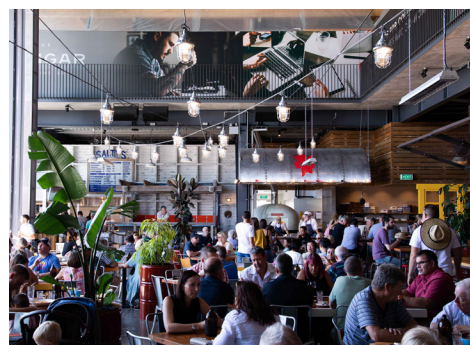
Little Creatures Brewery