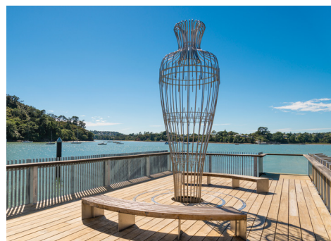
Didsbury Art Trail