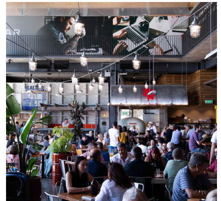
Little Creatures Brewery