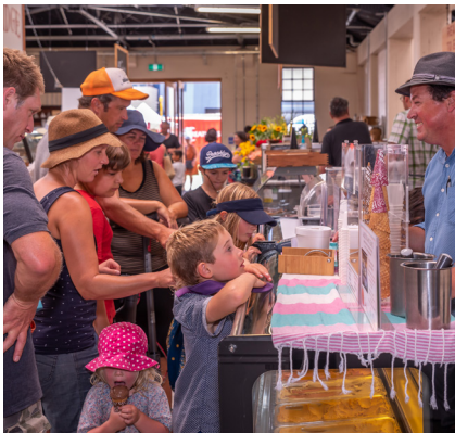
Catalina Bay Farmers Market

(behind Catalina Café) is open 10am–4pm daily. Our friendly information centre manager can give you an overview of the different neighbourhoods and builder partners, point you to the show homes, and answer any questions.