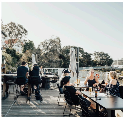
Fabric Café and Bistro