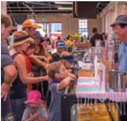
Catalina Bay Farmers Market

(behind Catalina Café) is open 10am–4pm daily. Our friendly information centre manager can give you an overview of the different neighbourhoods and builder partners, point you to the show homes, and answer any questions.