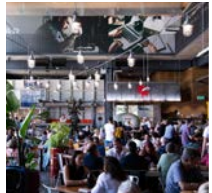
Little Creatures Brewery