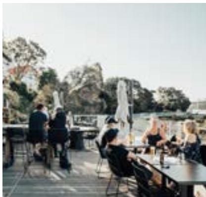
Fabric Cafe and Bistro