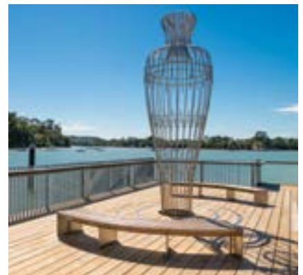
Didsbury Art Trail