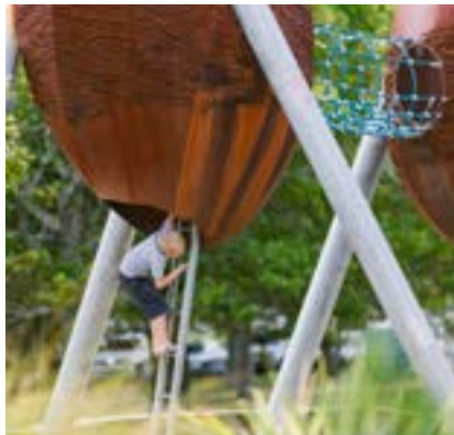
Hobsonville Point Playground