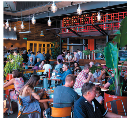
Little Creatures Microbrewery