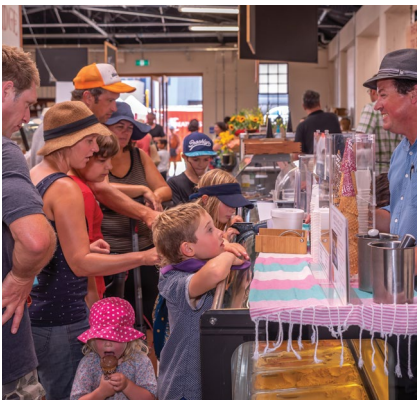
Catalina Bay Farmers Market

Centre at 1 Hastings Street (behind Catalina Cafe) to meet with our friendly Information Centre manager, who can give you an overview of the different neighbourhoods and builder partners, point you to the show homes, and answer any questions.