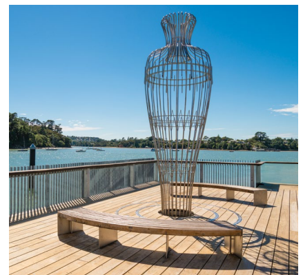
Didsbury Art Trail