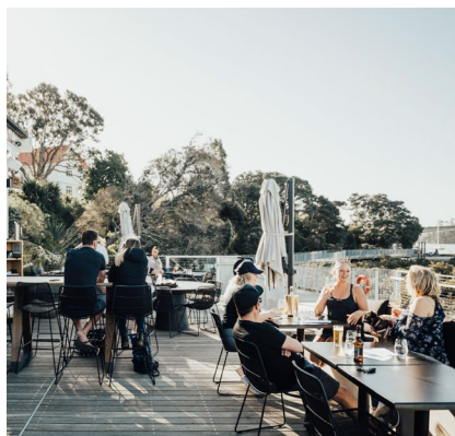
Fabric Cafe and Bistro