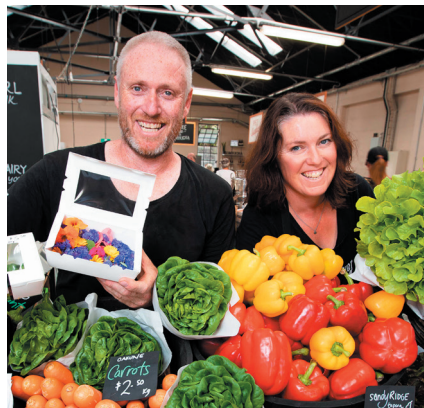
Catalina Bay Farmers Market