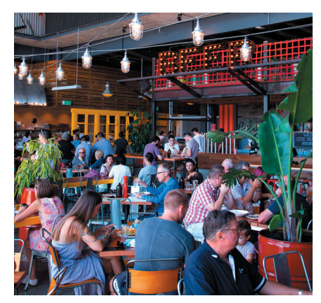
Little Creatures Microbrewery