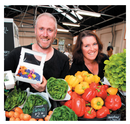
Catalina Bay Farmers Market