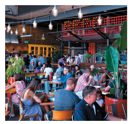
Little Creatures Microbrewery