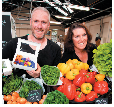
Catalina Bay Farmers Market