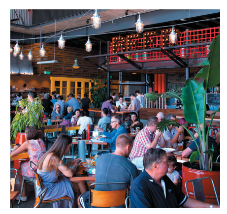
Little Creatures Microbrewery