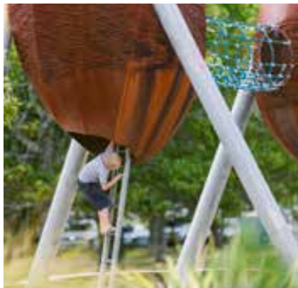
Hobsonville Point Playground