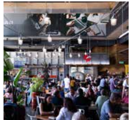
Little Creatures Brewery