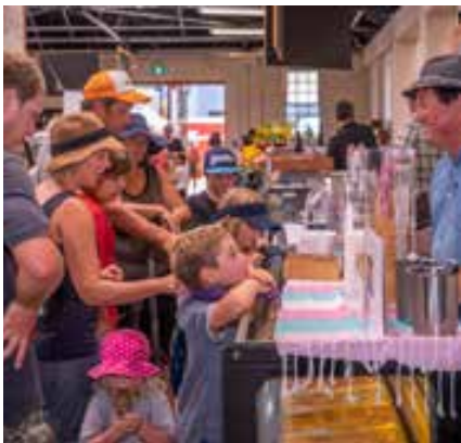
Catalina Bay Farmers Market

(behind Catalina Café) is open 10am-4pm daily. Our friendly information centre manager can give you an overview of the different neighbourhoods and builder partners, point you to the show homes, and answer any questions.