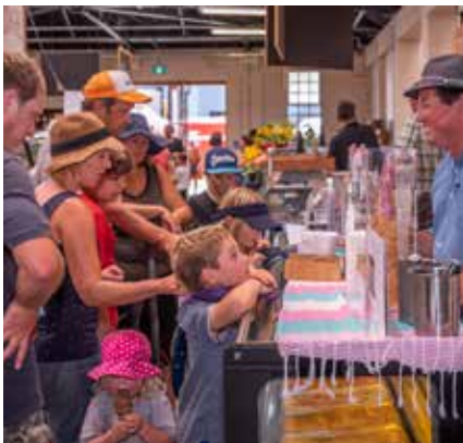
Catalina Bay Farmers Market

(behind Catalina Café) is open 10am–4pm daily. Our friendly information centre manager can give you an overview of the different neighbourhoods and builder partners, point you to the show homes, and answer any questions.