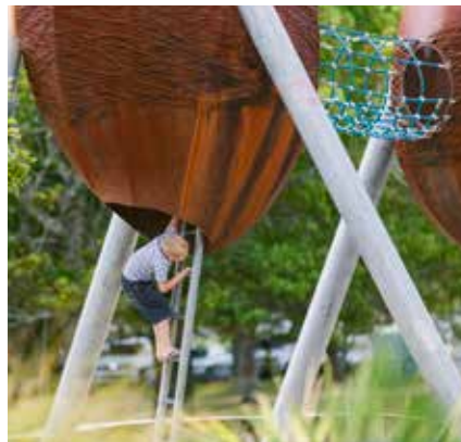
Hobsonville Point Playground