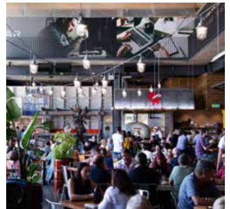
Little Creatures Brewery