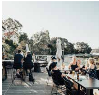
Fabric Cafe and Bistro