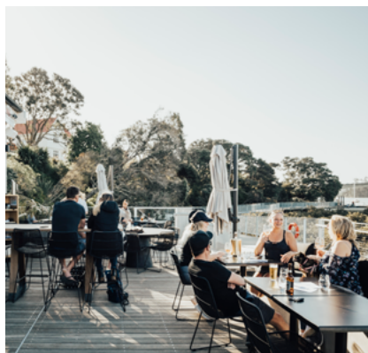
Fabric Cafe and Bistro