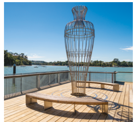
Didsbury Art Trail