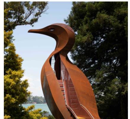
Te Kanohi o Te Manu