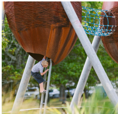
Hobsonville Point Playground