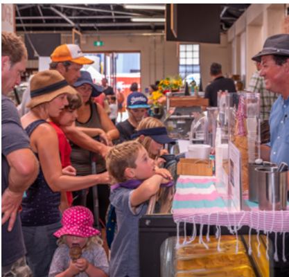
Catalina Bay Farmers Market

Information Centre manager at 1 Hastings Street (behind Catalina Cafe), who can give you an overview of the different neighbourhoods and builder partners, point you to the show homes, and answer any questions.