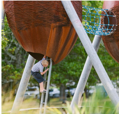
Hobsonville Point Playground