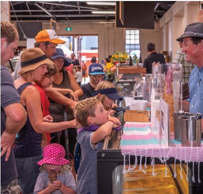
Catalina Bay Farmers Market

(behind Catalina Café) is open 10am–4pm daily. Our friendly information centre manager can give you an overview of the different neighbourhoods and builder partners, point you to the show homes, and answer any questions.