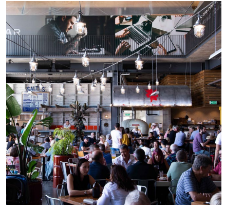
Little Creatures Brewery