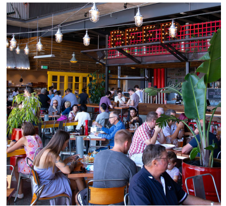
Little Creatures Microbrewery