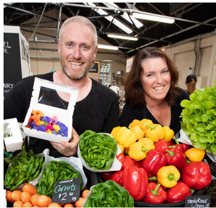
Catalina Bay Farmers Market