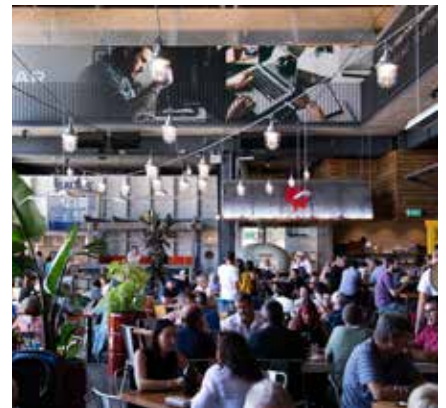
Little Creatures Brewery