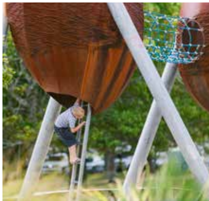
Hobsonville Point Playground