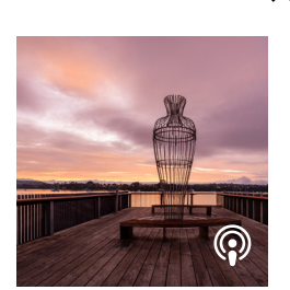
Hinaki / Guardian